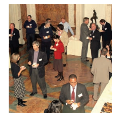
Delegates and speakers swap ideas over tea

A way of circumventing the vexing problem of how to test a drug in a whole human system – without actually exposing humans – was addressed by Hurel's (the name being derived from the words Hu man and Rel evant) biochip, which uses interconnected tissue pieces from the body's organs to represent the human body in miniature.